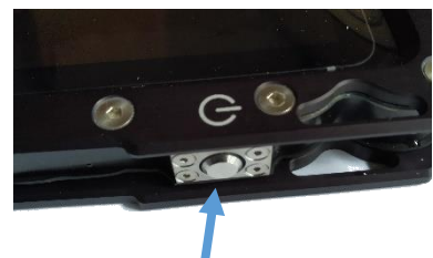
Power button / Unlock and lock screen